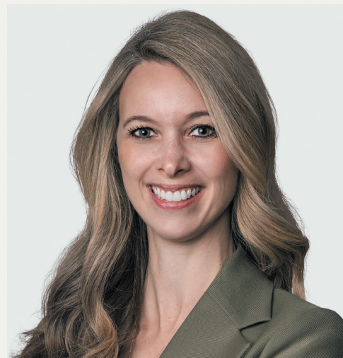
Gibson, Dunn & Crutcher LLP PALO ALTO